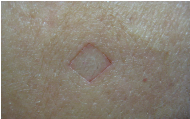
Figure 8: Red dermographic line of contact developed with small islands of edema after the patch test