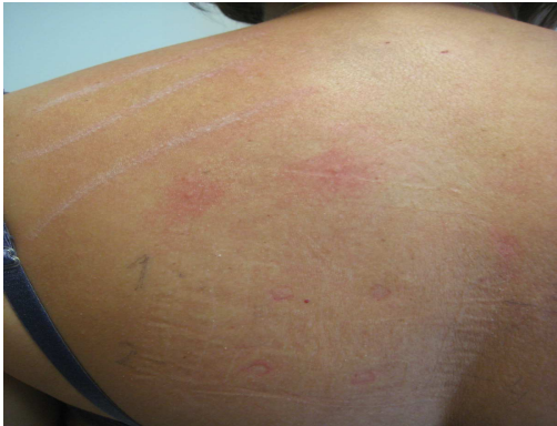
Figure 9: Pressure dermographism from scratching after 45 minutes