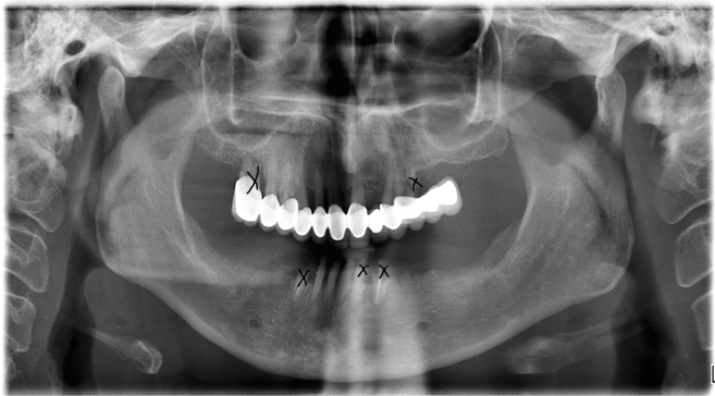
Figure 1: Panoramic view before treatment