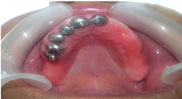
Figure 4: Reddened mucosal hyperplasia on the hard palate associated with burning sensation and bleeding following the dental treatment