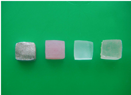
Figure 5: Patch test materials prepared by cutting with dimensions of 1.0 \pm 0.2 mm, 1.0 \pm 0.2 mm, and 1.0 \pm 0.2 mm.