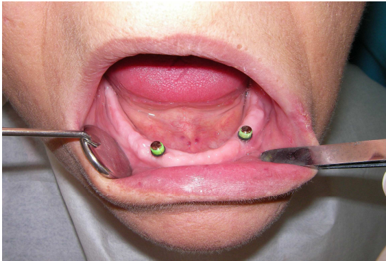
Figure 3: Two implant ball attachments placed for implant retained overdenture in her lower jaw