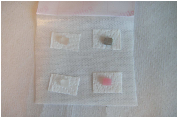
Figure 6: The samples just before placing on the upper back