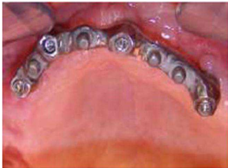
Fig 2, b. A Bar-Ball Superstructure was Fabricated