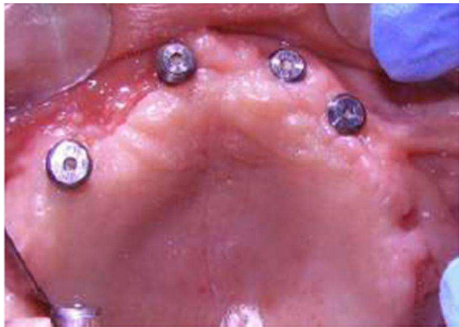
Fig2, c. The Removable Bar-Ball Denture was Made