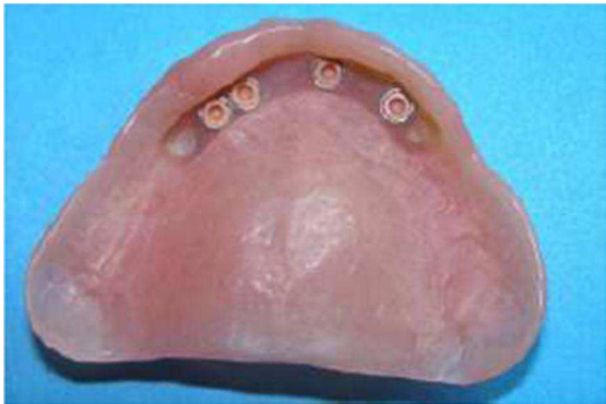
Fig 2, a. An Edentulous Maxilla with 4 Implants Inserted in Left Canine, Left Lateral Insicor, Right Central Incisor and Right First Premolar Location