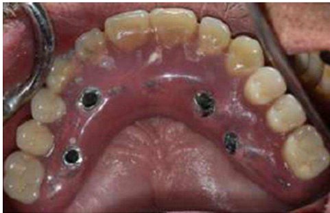
Fig 3. An Example of Fixed Hybrid Prosthesis

For each teaching cycle, the error (difference between the generated output and actual result) was propagated backward through the network to adjust the weightings of the nodes and