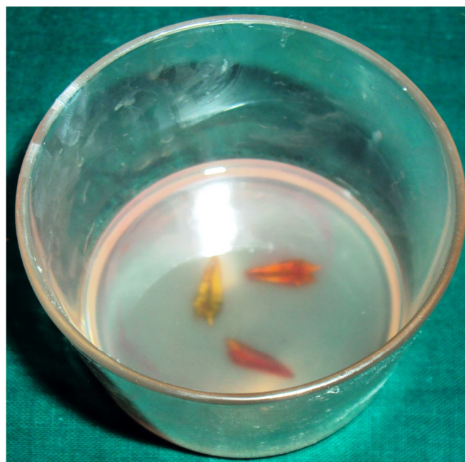
Figure 2: Showing Teeth Specimens Dipped in Embalming Paste

sunlight till they become dry. Teeth were placed in methylsalicylate (Vatanpour M and Javidi M 2007, Omer OE et al 2004) for clearing, until they become transparent. Disposable plastic tea cups (Vidya M et al 2009) were cut into small pieces (1x1cm approximately), added to jar containing xylene, mixed properly until they form a smooth, homogenous embalming paste (Figure 2).