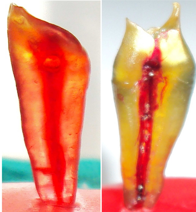
Figure 3A and 3B: Showing Teeth Specimens with Dyed Pulp Canal Morphology

naturally for 2-3 hrs. Resulting specimen were dry and non-sticky showing dyed pulp canal morphology (Figure 3A and 3B).