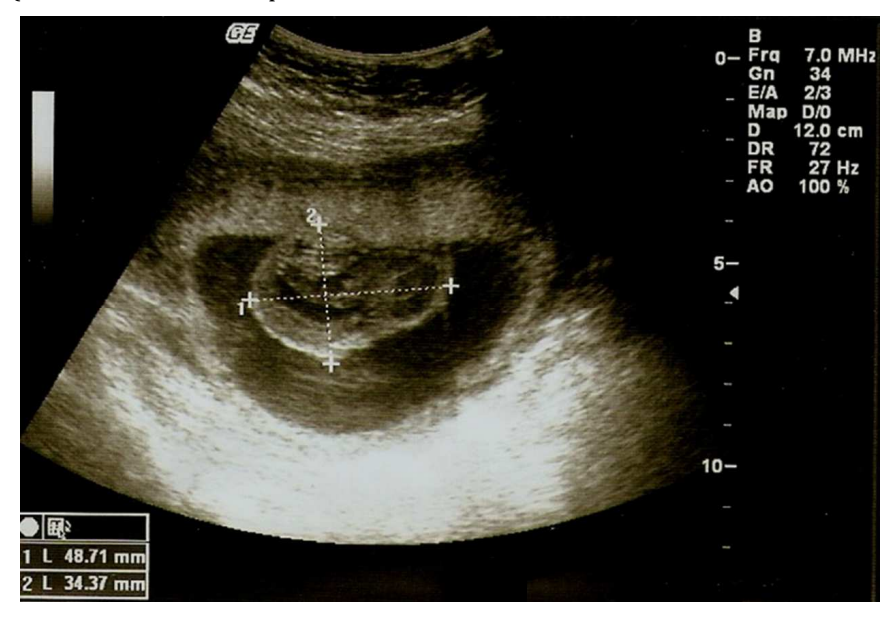
Figure 1: Subamniotic haematoma, at 12 weeks gestation, by ultrasound scan

In the 1<sup>st</sup> trimester ultrasound scan, at 12 weeks gestation, it was observed a hypoechogenic image, indissociable from the placenta, with 49 mm of diameter – see figure 1.