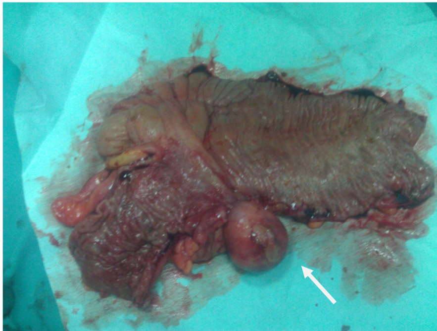
Figure 2: Resected Right Hemicolectomy Specimen Showing Ileocaecal Mass (Arrow)