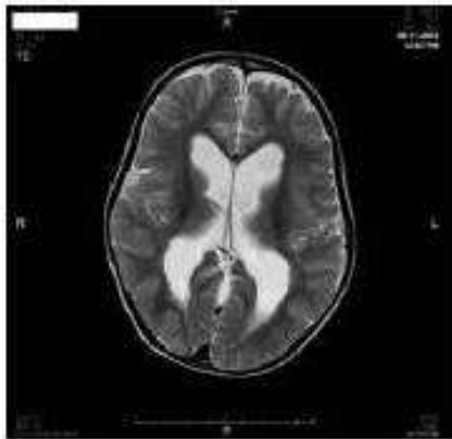
Figure 5: Ventriculomegaly on MRI