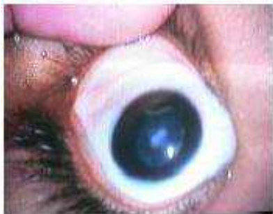
Figure 2: Polar Cataract in the Patient's Right Eye.

The dimensions of cornea were normal, but topographically keratoconus was present (Figure 3).