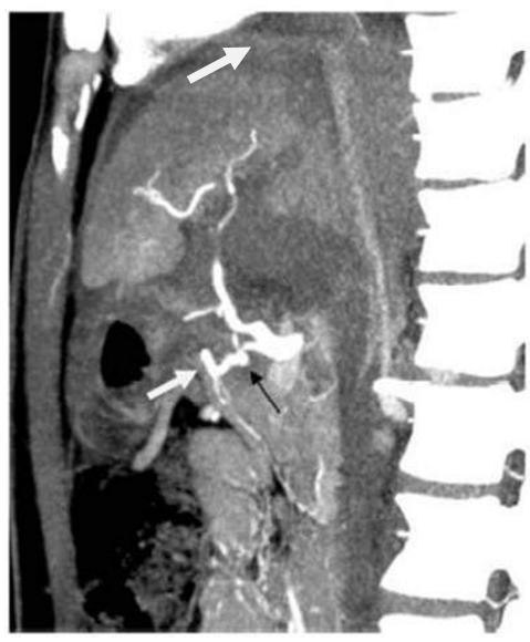
Figure 1b: MIP Images in Axial, Magnified Axial, and Sagittal Views Demonstrating the Pseudoaneurysm (Black Arrows) Arising from the Gastroduodenal Artery (White Arrows).

Patient underwent emergency exploratory laparotomy which showed haemoperitoneum with clots of around 750ml. There was 3x6 cm haematoma over the anterior surface of head of pancreas