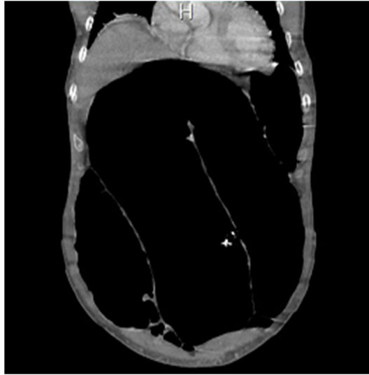
Figure 2(A) Showing a Markedly Dilated Large Bowel Loop with Inverted U Shape, Exerting a Coffee-Bean Appearance