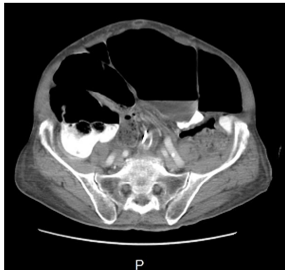
Figure 2(B) Post Contrast CT Scan Abdomen Showing Markedly Dilated Large Bowel and Mainly Sigmoid Colon, with Air-Fluid Level

The patient was diagnosed with sigmoid volvulus, and he underwent colectomy with colostomy. He was weaned from ventilator and later on discharged from the hospital.