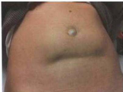
Figure 1: Clinical Appearance of the Lesions before the Surgical Treatment