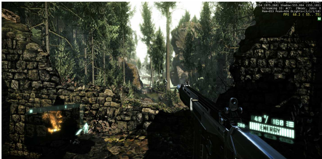
Figure 1: Screenshot from the CryENGINE3

The CryENGINE supports a number of features that are useful for creating immersive and realistic serious games, such as real-time world editor, bump mapping, dynamic lights, an integrated multi-threaded physics engine, shaders, shadow support, multi-core support, character animation system, pathfinding, dynamic sounds and interactive music. The engine supports all currently available hardware and it is updated with further hardware support when it becomes available.