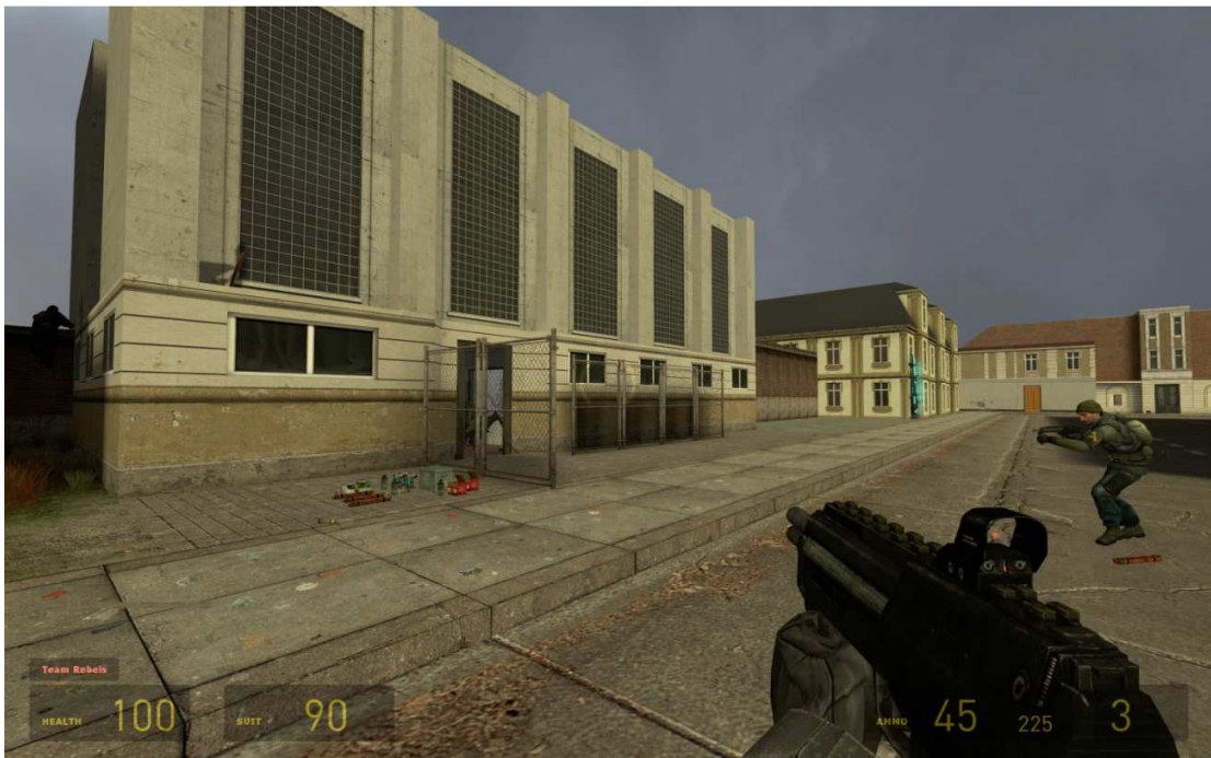
Figure 2: Screenshot of Half Life 2

The third engine is the Unreal Engine 3 (Games 2009), which has a complete game development methodology for next-generation consoles and DirectX9-equipped PC's, providing the vast range of core technologies, content creation tools and support infrastructure required by top game developers. The engine supports high performance rendering, advanced animation and high-quality dynamic lighting. Supported