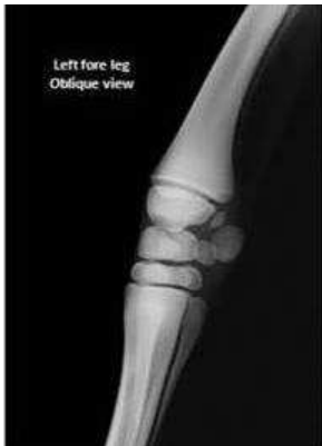
Fig. 2. Radiographic Appearance of the Premature Carpus