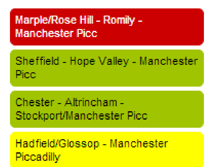
Figure 1: Sample Journey Check Rainbow Board Output for Northern Rail

Rainbow Boards take route disruption information, movement data and train disruption, and compare the service frequency and disruption against the timetable on a rolling 60-minute basis. Depending on the level of route disruption, or the proportion of train disruption against the planned service, different disruption levels are determined - generally, good service, minor delays, and major disruption -