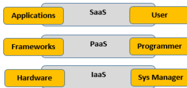
Figure 2: Services Layers of cloud computing

The state of the art review of CC has a three-tier model, as illustrated in figure 2 IaaS_PaaS_SaaS. Each layer defines a service model. The three layers are Infrastructure as a Service (IaaS), Platform as a Service (PaaS) and Software as a Service (SaaS). Next is made a brief characterization of each of these layers or service models.