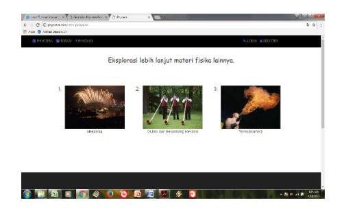
Fig. 4b:Mechanics Materials