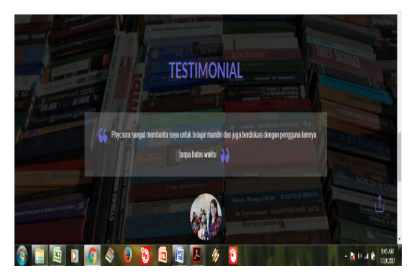
Fig. 8: Testimonia