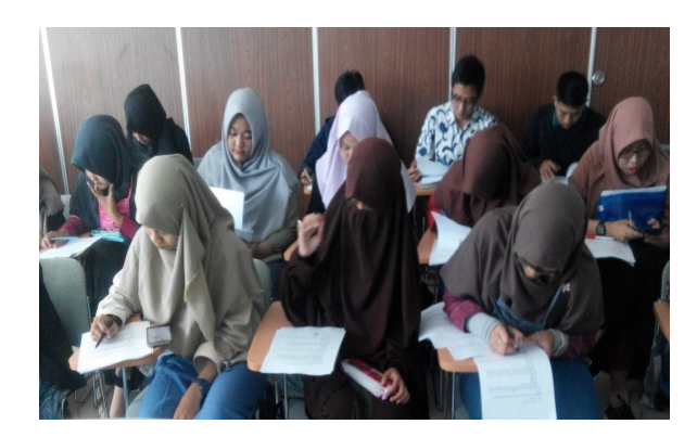
Fig. 5a: Pre-Test (before with E-Learning)