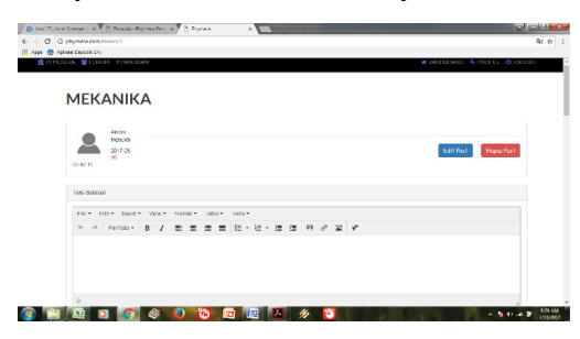
Fig. 4a: Mechanics Subject