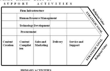
Figure 2: The Value Chain Analysis Model of religious-based entrepreneurship (source: adapted from Manaf et al, 2015)\

From the value chain analysis of the da'wah enterprise, the end value is not about profit margin but strategic goal to sustain the operation in order to achieve the goal of religious outreach. The analysis we made revealed that religious-based entrepreneurship conveys religious values instead of the norm of product values. This finding is aligned to the first two key features of social enterprise as described by Galera and Borzaga (2009). The resulting value chain analysis of the da'wah enterprise is shown in Figure 2.