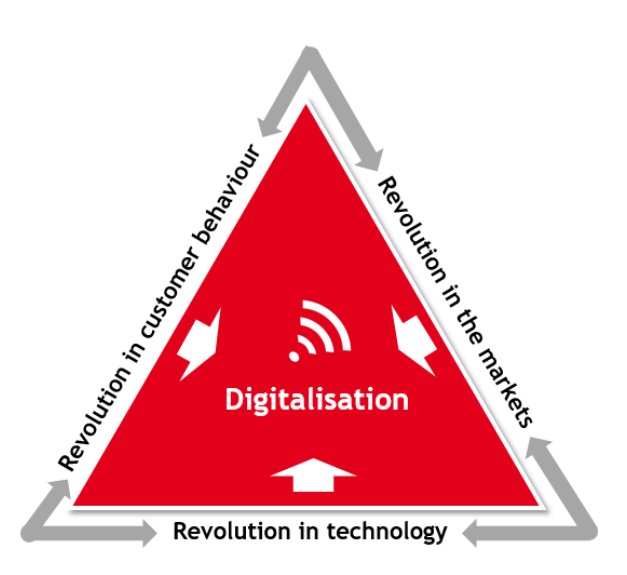
Fig. 2: Major changes related to digital transformation (Ilmarinen and Koskela, 2015).