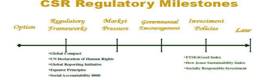
Figure 1: AAIB's CSR Regulatory Milestones (AAIB, 2010: 10)

As such, AAIB has developed CSR regulatory Milestones reflecting stages of CSR adoption for corporations, moving from a mere option to adopting regulatory frameworks, to accommodating to market pressures, complying with governmental encouragement, along with investment policies to end up with law compliance (Figure 1).