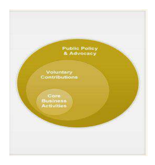
Figure 5: Spheres of CSR Influence of AAIB (AAIB, 2010: 15)

Finally, such successes postulate AAIB as a success story at the heart of a renowned ruthless industry for its fierce competition by relying and reformulating its strategies around concepts of sustainability, corporate social responsibility and multiple stakeholders' perspective. To continue its growth and success and to achieve shareholders satisfaction, a clear and efficient corporate governance framework has been established. Finally, AAIB stands as a unique banking and financial success experience in Egypt and MENA region. It had succeeded in embedding the CSR notion within the banking sector as a strategic cornerstone serving multiple stakeholders, by which evading the myth of profitmaximizing behavior of banks. Its efforts earned it the UN