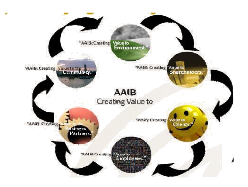
Figure 2: CSR Multiple Stakeholders' Model (AAIB, 2010: 23)

targets for improvements across all areas of the bank's performance became the center or the focal point to the achievement of sustainable growth. Figure 2 shows the stakeholders AAIB addresses in its strategy.