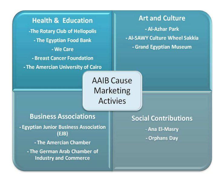
Figure 4: AAIB's cooperation for Community (AAIB, 2010: 40)

In light of AAIB's CSR vision, AAIB supports and cooperates with different organizations active in several fields in Egypt such as health, culture, and education. In fact, AAIB is considered one of the most active promoters of community service organizations, AAIB's philanthropic activities fall into the following four categories as shown in figure 4 below.