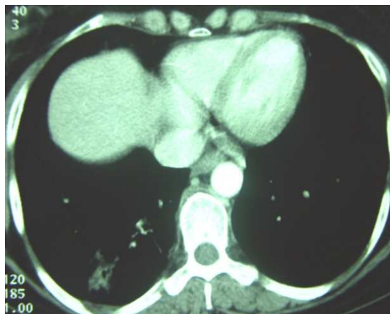
Fig.4: Improvement of Pulmonary Lesion with Corticosteroid Therapy

AAN and ANCA search was negative. Since sarcoïdosis was suspected, corticosteroid therapy was initiated in March 2012, justified by naso-sinusal localization. On the other hand, thoracic lesions since asymptomatic with no functional impact, did not justify corticotherapy. The patient was treated by prednisolone 0.5 mg/kg body weight/day, associated to ATT which was stopped one month later. Improvement in nasal obstruction was remarkable within 2 weeks. The patient became totally asymptomatic six months later. After 12 months patient still asymptomatic under corticosteroid therapy (prednisone, 7.5 mg/day). Cranial and thoraco-abdominal computed tomography scan showed an important improvement in pulmonary and sinusal lesions (fig.4).