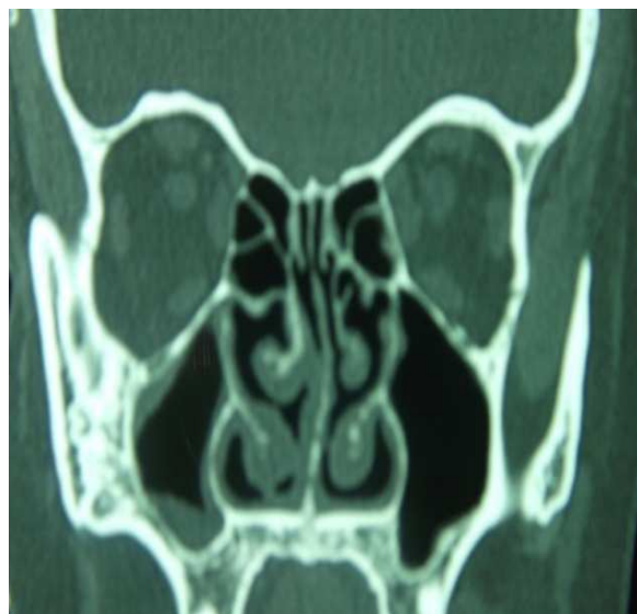
Fig.2. Thickening of Nasal Cavity and Right Maxillary Sinus Mucosa. (Marsh 2011)