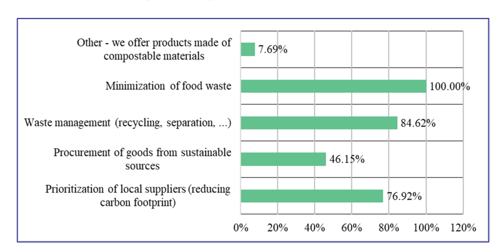
Fig. 2: Sustainability elements already applied in researched companies

The second question in the survey focused on the identification of the level at which the entrepreneurs are already actively engaged regarding the sustainability elements. The results are shown in Fig. 2.