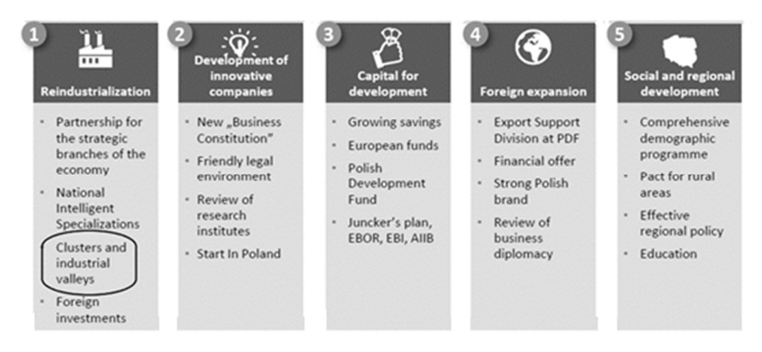
Figure 2: Five pillars of the economic development of Poland