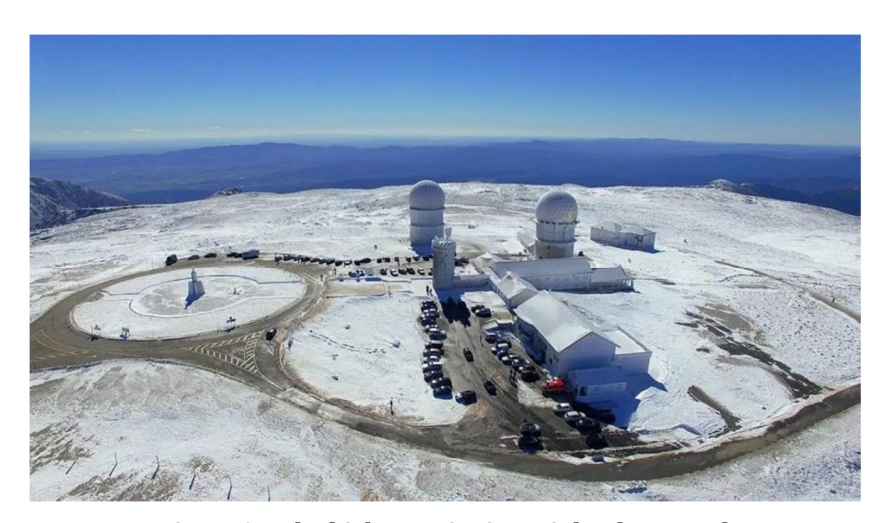
Figure 2 - The highest point in mainland Portugal

The Cordillera Central is the most important mountain system in Portugal, and at its highest point, the Torre, Serra da Estrela reaches an altitude of 1993 meters (figure 2). This mountain thus occupies a prominent position, presenting an unparalleled value in terms of geographic and geological heritage.