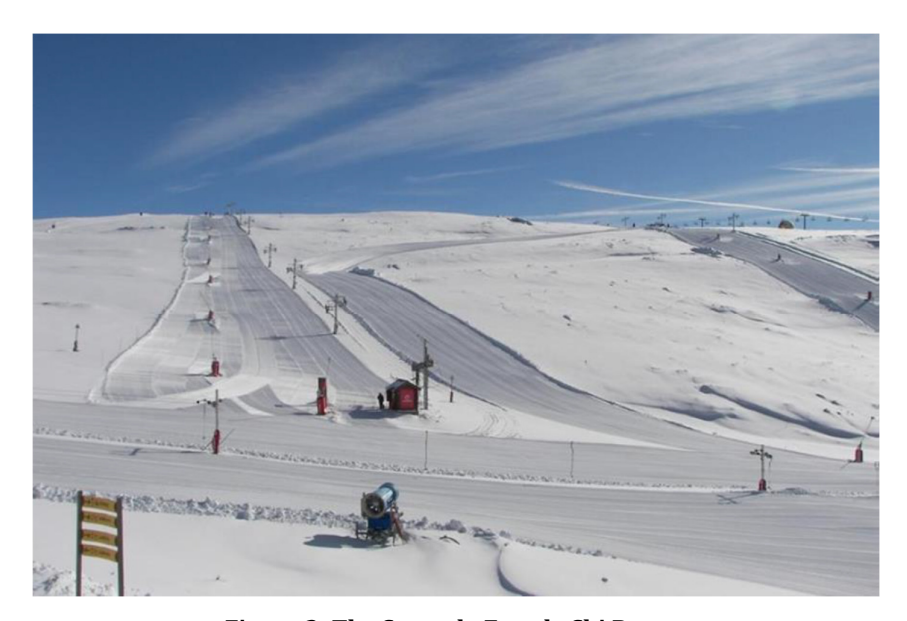
Figure 3: The Serra da Estrela Ski Resort

Skiing is, therefore, the sport par excellence practiced over the years in Serra da Estrela, and in recent years another sport, snowboarding, has become popular, especially among the younger layers. For the practice of these modalities, there is, in the Tower, the highest point of the entire Serra da Estrela, the Ski Resort of Serra da Estrela, located at 2000 altitude. This resort is equipped with the most recent facilities, housing all the necessary infrastructures for the practice of these modalities, being equipped with modern and sophisticated equipment: such as state-of-the-art mechanical means, a system identification of ski passes, one of the most modern in Europe and an innovative artificial snow production process that ensures 120 to 150 days of snow per year (figure 3).